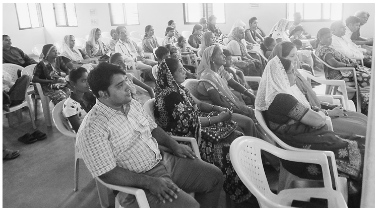
Members gather Ahmedabad