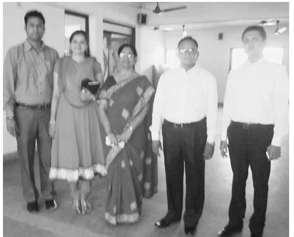
Bishop and family