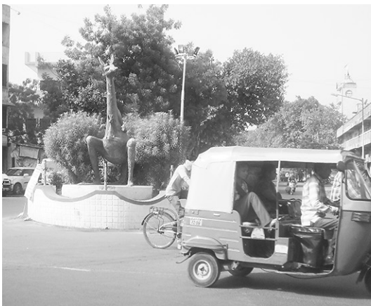
Statue of kangaroo on street corner

Friday 5 th . June 21 st is National Yoga Day in India and looking out of the window, all the roof tops are full of people meditating and practicing. According to the news, even the schools have been told, 'No lessons only on Yoga'. Many teachers are not happy to lose a day of schooling. The newspaper published a poll on people's thoughts on destroying noodles. 37% agree and 36% said more chance of getting ill from water and air.