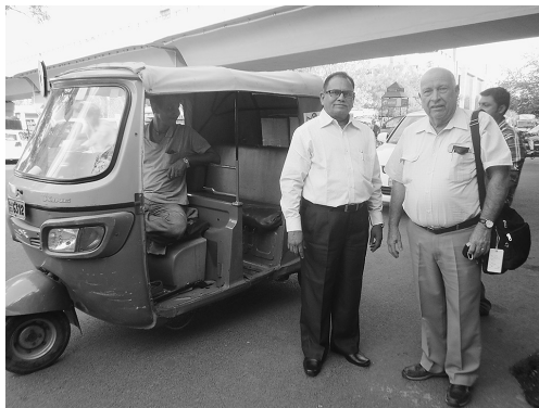
Took rickshaw for books