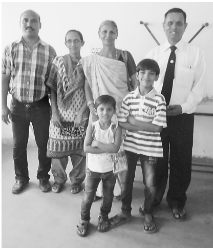
Priest and family