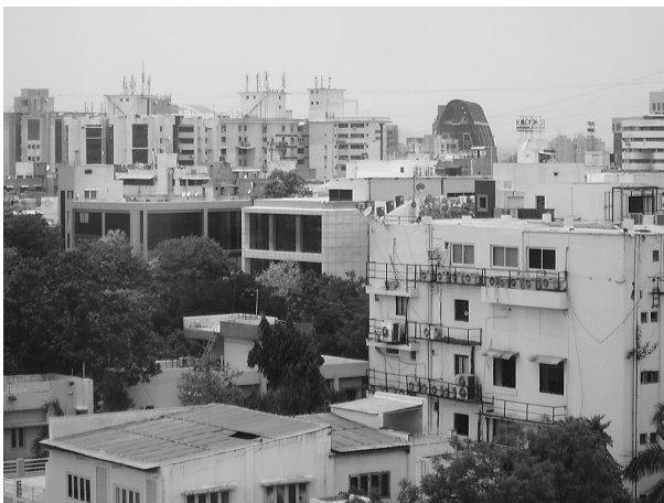
View from hotel