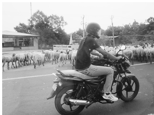
Sheep roam highway