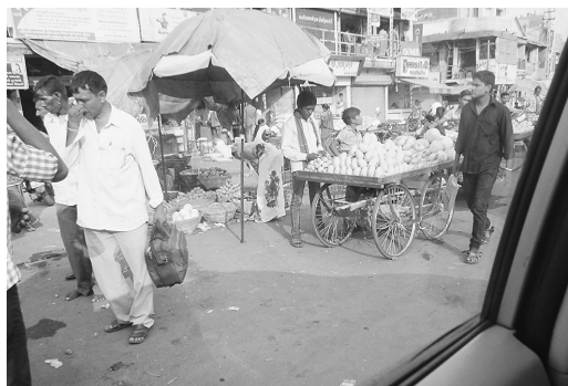
Street side markets

city branch of BPI Bank to try to sort out for Europe, bank transfer. It was a long shot (for India) but at least we were given some advice on how to achieve it. So to the next stage. Afternoon seminar until 4:15 then teatime. Indians without their teatime (so sweet and pre made), are like vehicle without fuel. Because we were a little later, the traffic was really heavy. They may as well switch the traffic lights off as no one takes any notice. Fuelled the car, diesel price here approximately $1 (Aust). Back to Hotel