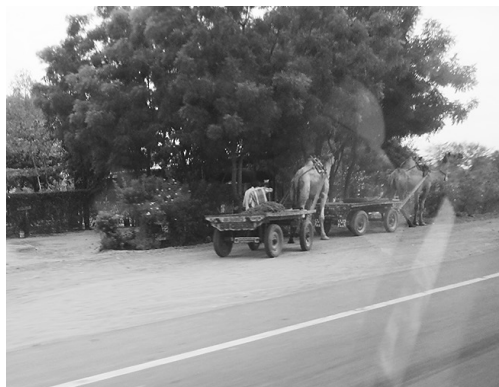
Camels used for transportation