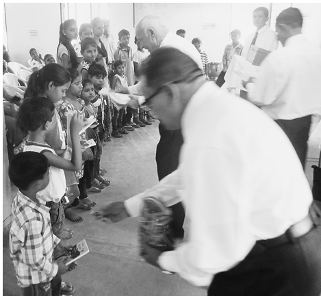
Children receive gifts