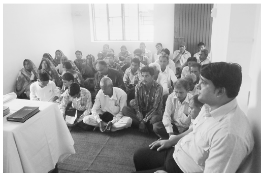
Ready for service