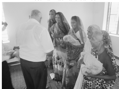
Widows receive a sari