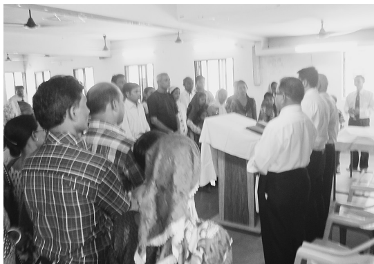
Those to be sealed are addressed