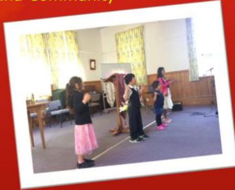
Children's dancing presentation at Church Service

Endeavouring to keep the unity of the Spirit in the bond of peace. - Ephesians 4:3