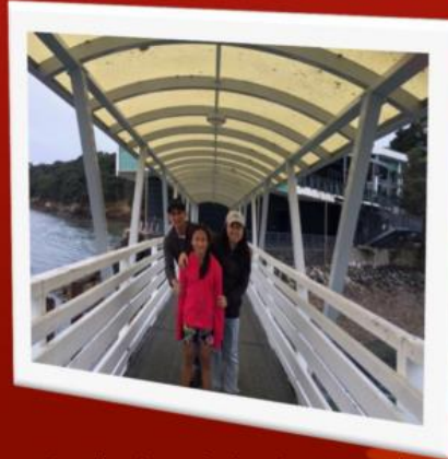
Family time during Long weekend