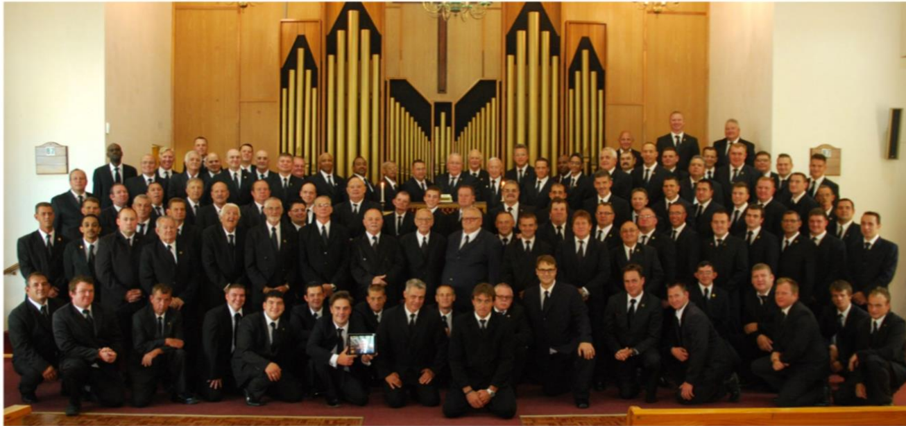
Some of our brothers and sisters in South Africa.

THE OPENING OF THE YEAR COMMENCED AND TOOK PLACE IN OUR CROSBY CATHEDRAL ON SUNDAY THE 17TH JANUARY 2016 FOR GAUTENG