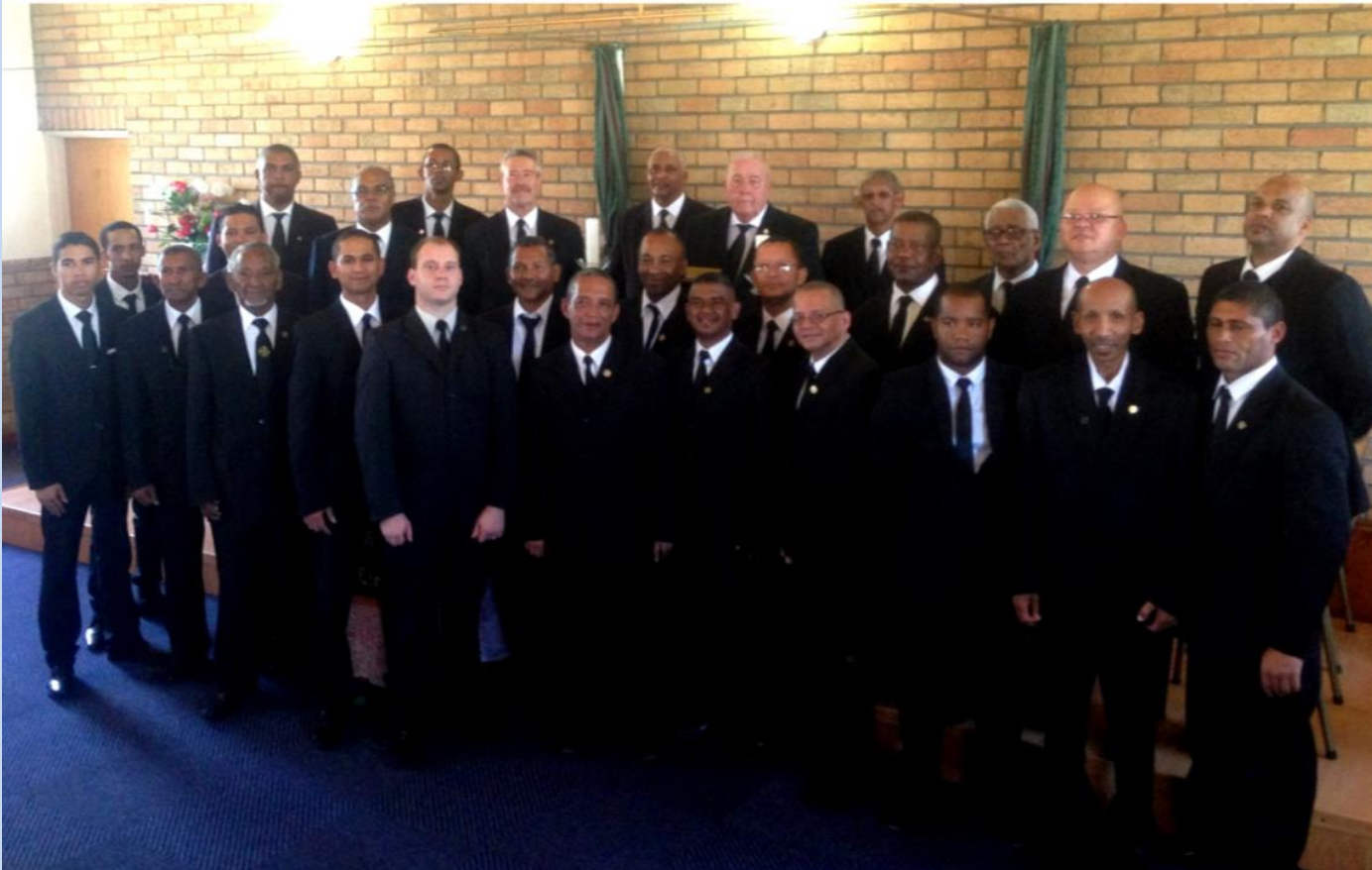
Apostle Erasmus in South Africa during a visit to the Western Cape